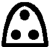
Three round pins arranged in a triangle