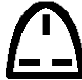
Two parallel flat pins with ground pin.

If your appliances plug has a different shape, you may need a plug adapter.